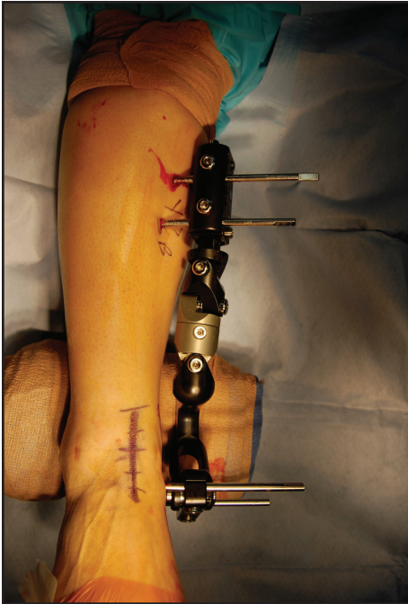
Figure 8-6. A unipolar external fixator placed across the ankle joint provides temporary distraction that facilitates surgical exposure.