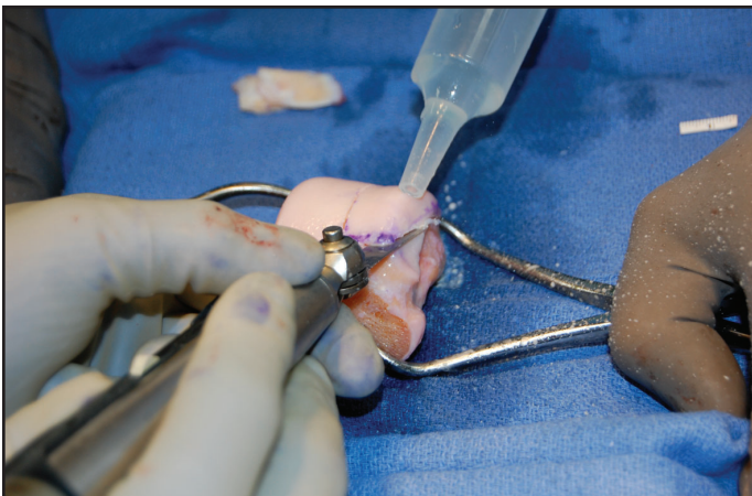
Figure 8-8. The allograft is removed from the donor talus following similarly performed resection along the measured and marked dimensions of the recipient site.