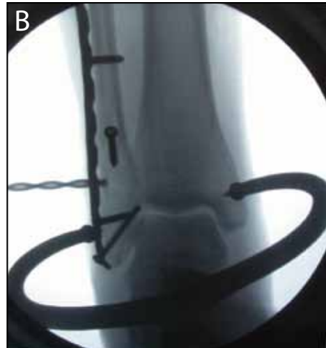
Figure 31-4. (A) Dissection anterior to the fibula onto the tibia with application of a lamina spreader to allow visualization of the syndesmosis. (B) After débridement of the syndesmosis, the fibula is reduced into the incisura and held with a bone clamp prior to fixation.

placed across three or four cortices of bone. Screws should be placed 2 to 5 cm proximal to the plafond. Newer implants, including absorbable and suture devices, are also available for fixation of the syndesmosis. The advantage is that these implants do not require removal, but there is some concern that failure of fixation and subsequent widening of the syndesmosis may occur with these devices. Regardless of the implant chosen for fixation of the syndesmosis, the authors' preferred postoperative treatment