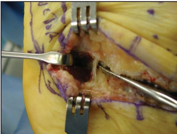
Figure 9-3. The superficial and fascia of the abductor hallucis is released and the deep fascia is shown. The lateral plantar nerve lies directly beneath this layer.