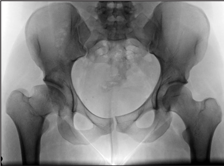
Figure 11-4. Preoperative radiograph of a 22-year-old woman with a dysplastic right hip and Perthes-like deformity of her right hip.