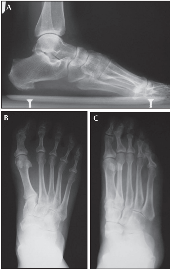
Figure 11-5. Standard weight-bearing radiographs of the foot should include (A) lateral, (B) AP and (C) oblique views. Routine evaluation should include overall alignment, assessment of degenerative arthritis, calcific tendinopathy and the exclusion of additional sources of pain.