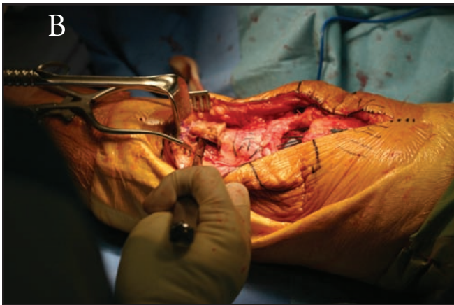
Figure 17-6. (A) The proximal part of the tibia is prepared for insertion of the calcaneal bone block. A small saw is used to make a rectangular/trapezoidal cavity. (B) Osteotome is used to lift out the unwanted bone.