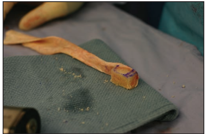
Figure 17-9. A "key stone" is created to maximize friction fit and bony contact.