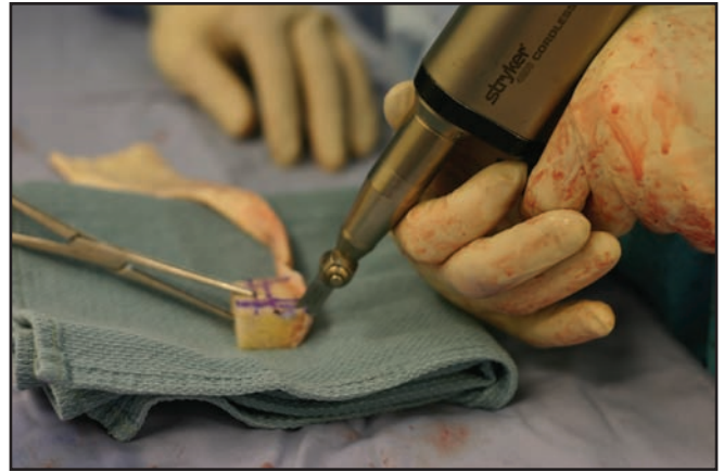
Figure 17-8. The calcaneal bone block is cut to match the created rectangular/trapezoidal space in the proximal tibia.